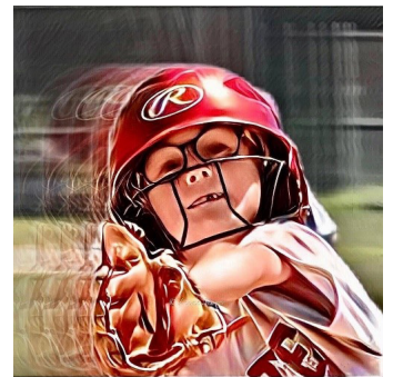
Both Images ©Linda Stager