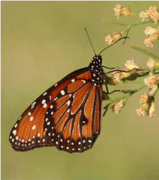
Taken at f8