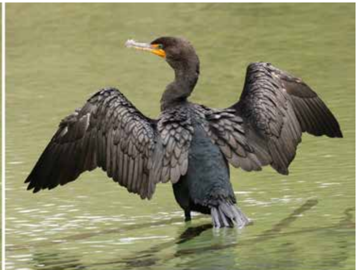
Resting on a railing at 1/40 sec