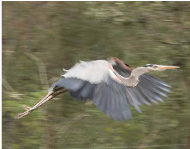
1/160 sec shutter speed

DEPTH OF FIELD: Back in February of 2013 I wrote an article about Depth of Field (DOF). This is very important in respect to what in your image is sharp and what is not. If too much of your photo is sharp, for example; you want the background blurry, you need less DOF. If not enough of your photo is sharp or in focus, you need more DOF. But there are times when no matter what you do, you cannot get the entire image sharp. Please review that 2013 article to learn more.