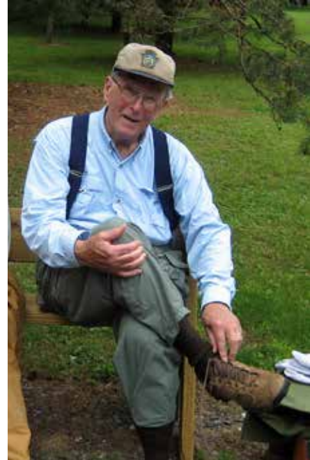
fishing trip on Kettle Creek