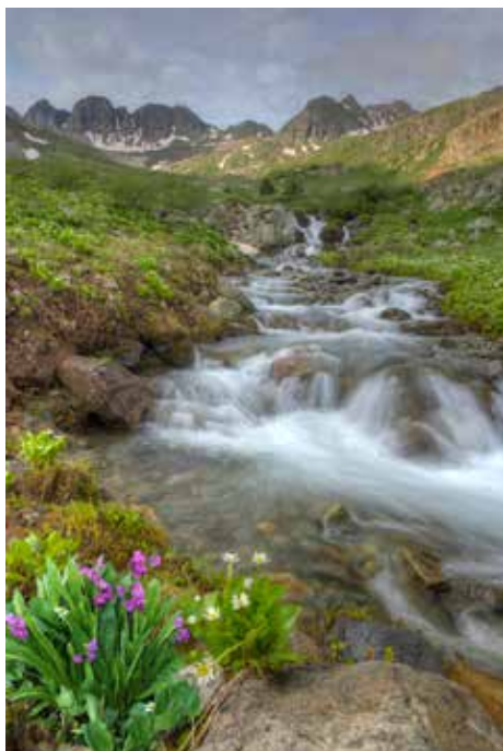
Taken at f16