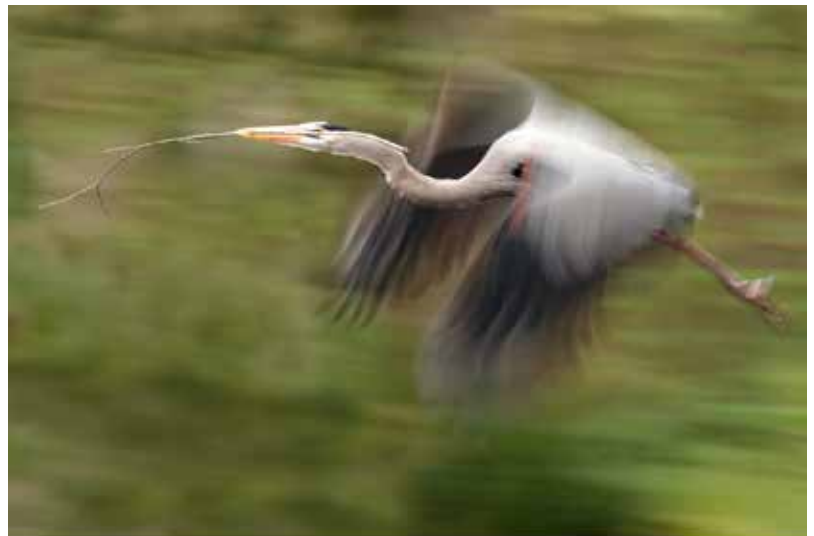
Taken at f9, 1/30 sec while panning