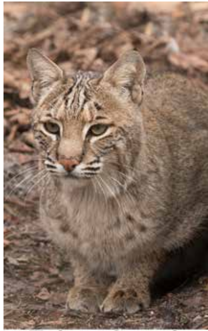
Taken though a fence