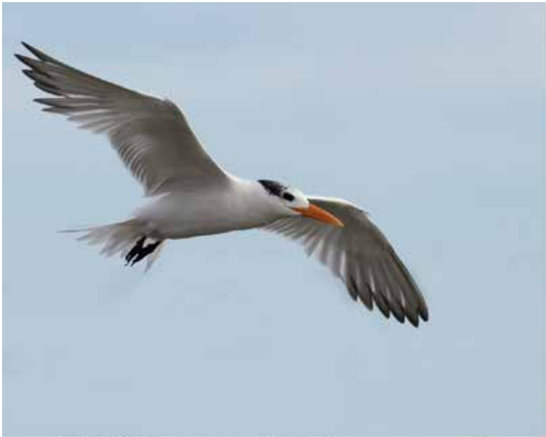
1/2000 sec shutter speed