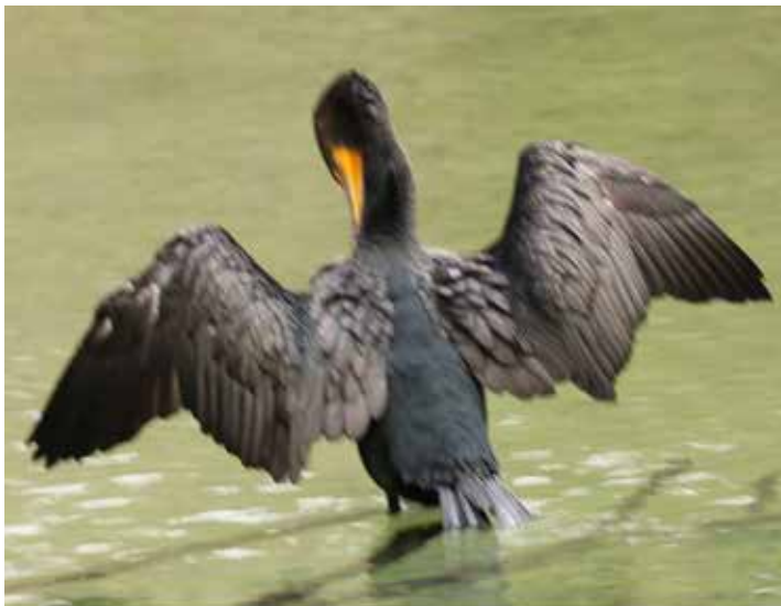
Hand held at 1/40 sec

CAMERA MOVEMENT: Holding the camera steady while taking a shot is important. Use both hands, one under the lens. You can brace your arms on your chest and spread your legs for stability. You can also lean against something like a tree, or rest the camera on a ledge. Ideally, for the best shots you should use a tripod.