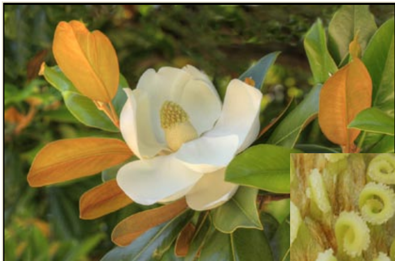
No one correctly guessed last month's mystery, the center of a Southern Magnolia, contributed by Ann Kamzelski

We are looking for people to submit their mystery macros, the more mysterious the better. To submit your mystery, email the mystery image and solution to the address below.