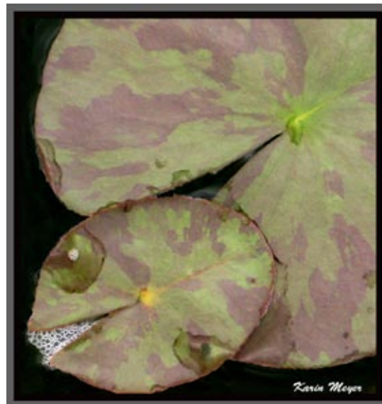
Creature from the Deep