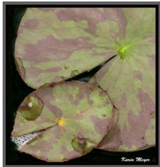
Creature from the Deep